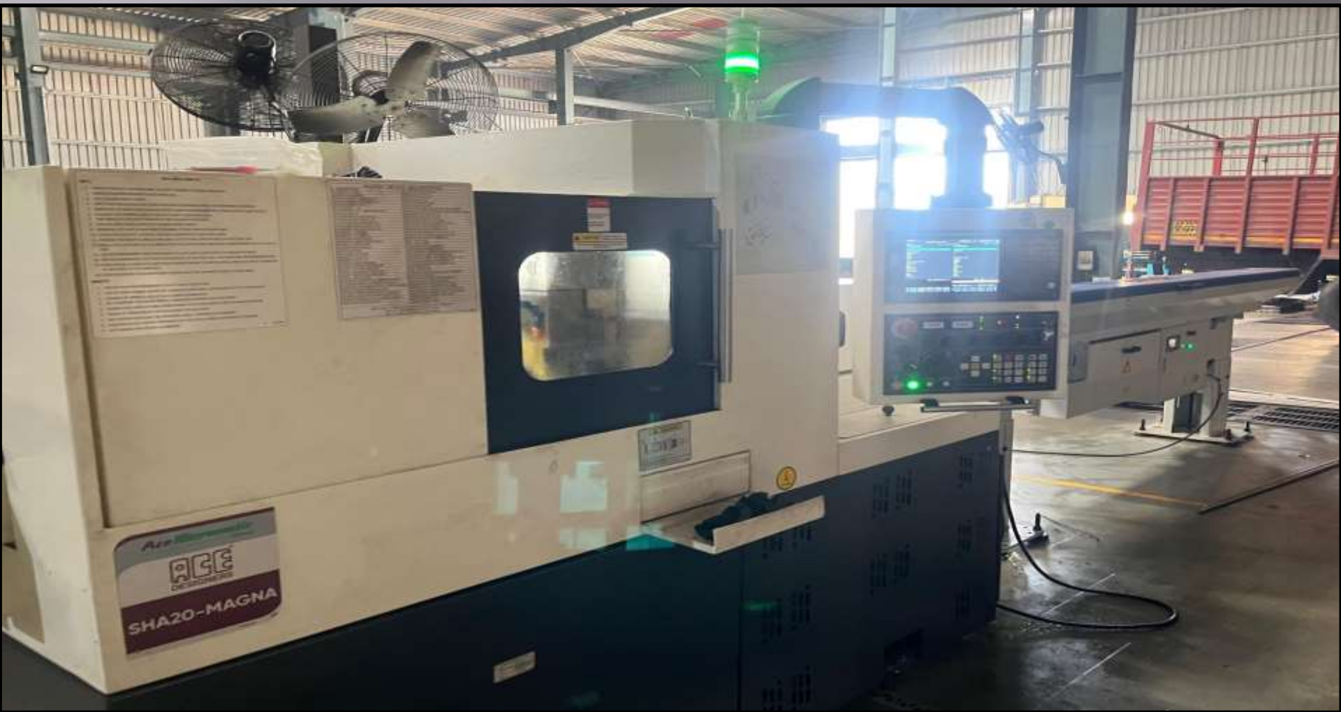
5 AXIS SHA20-MAGNA ACE