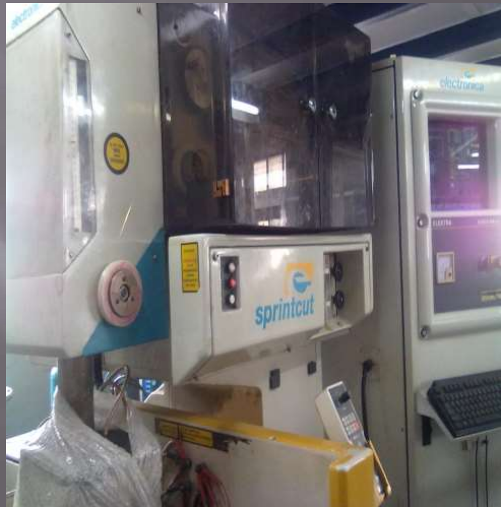
CNC EDM WIRECUT “ELEKTRA MAKE”