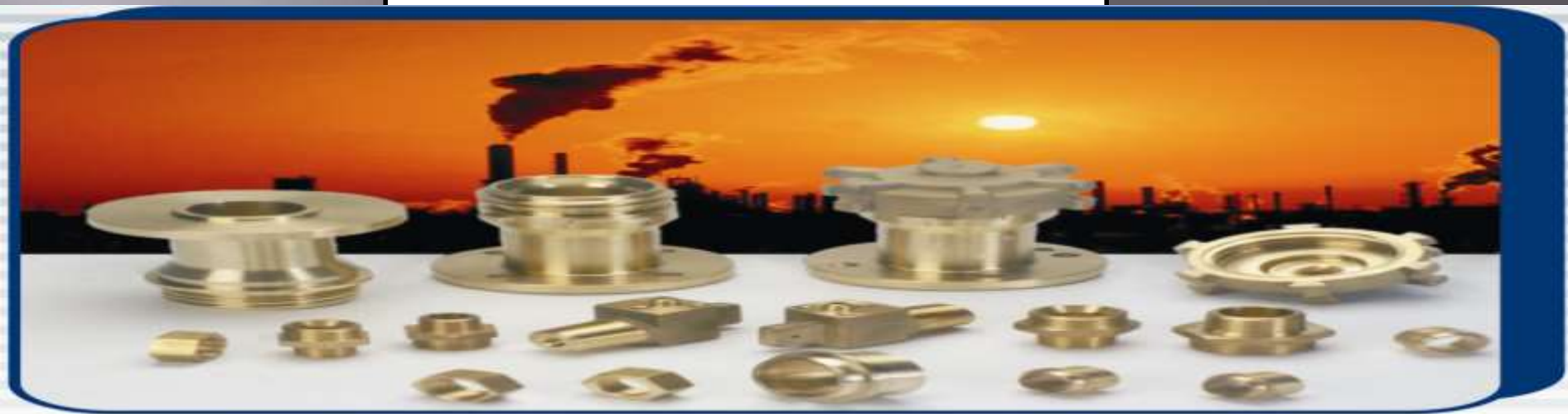
Gas Industry Components