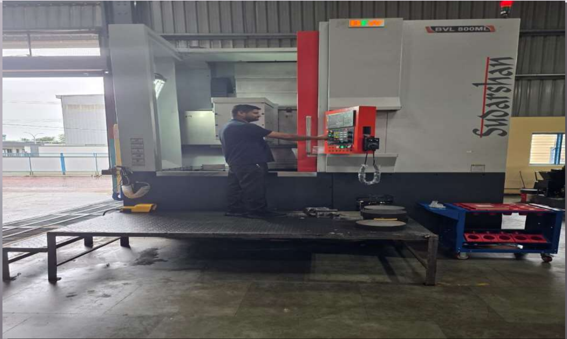
VERTICAL TURN-MILL CENTER-BVL 800-ML