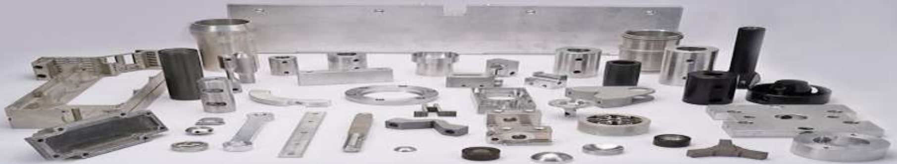
Power Transmission Components