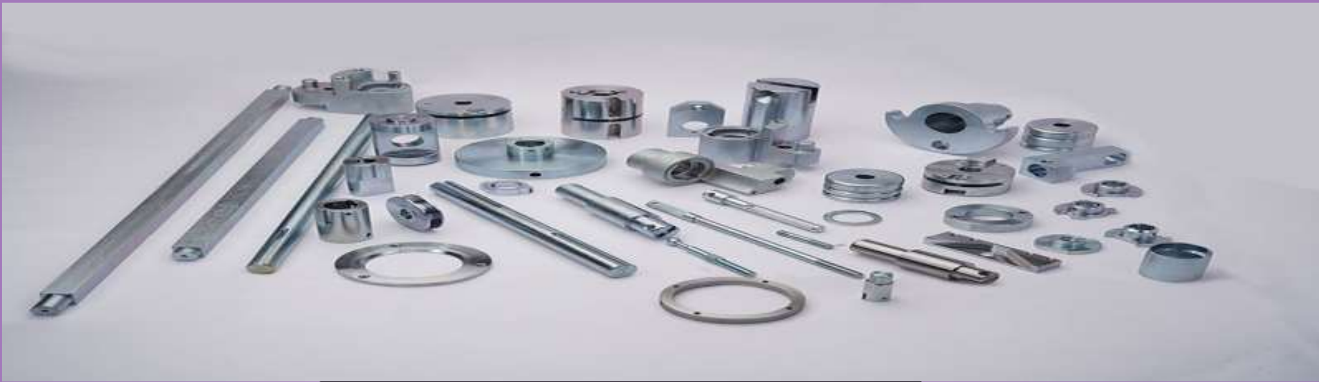
Electronics Industry Components