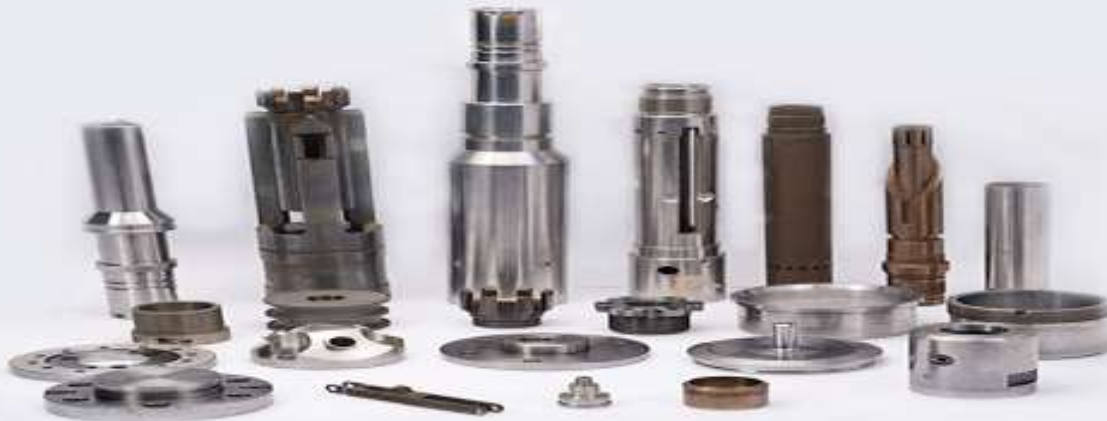
Oil Industry Components