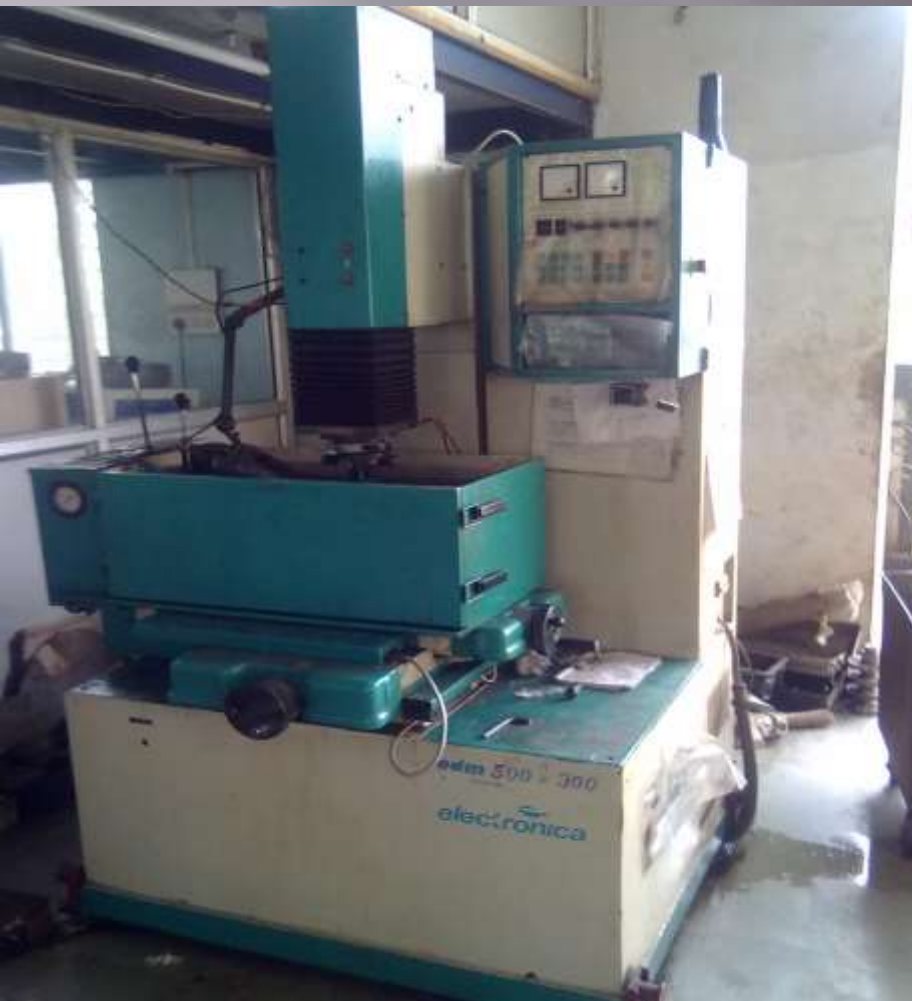
EDM SPARK MACHINE “EKEKTRA MAKE”