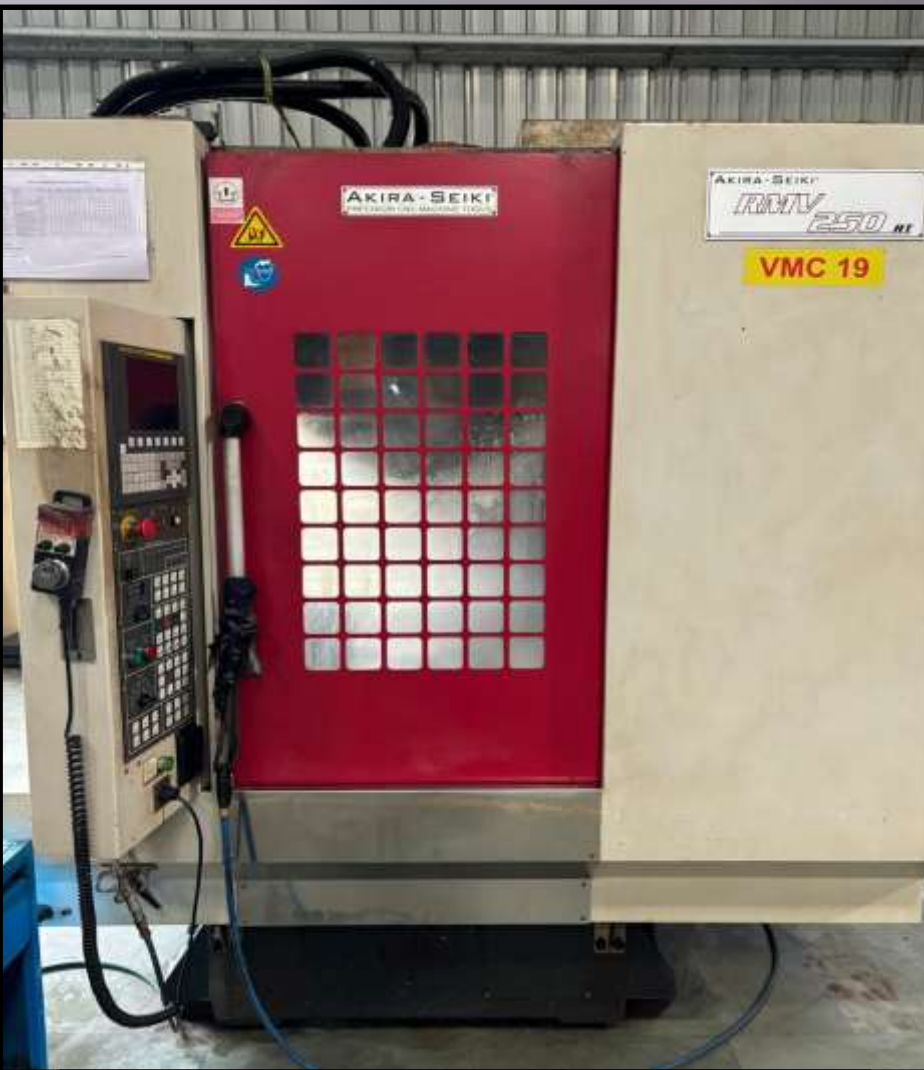
AKIRA-SEIKI RMV 250 '5-AXIS'