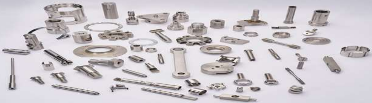
Power Transmission Components