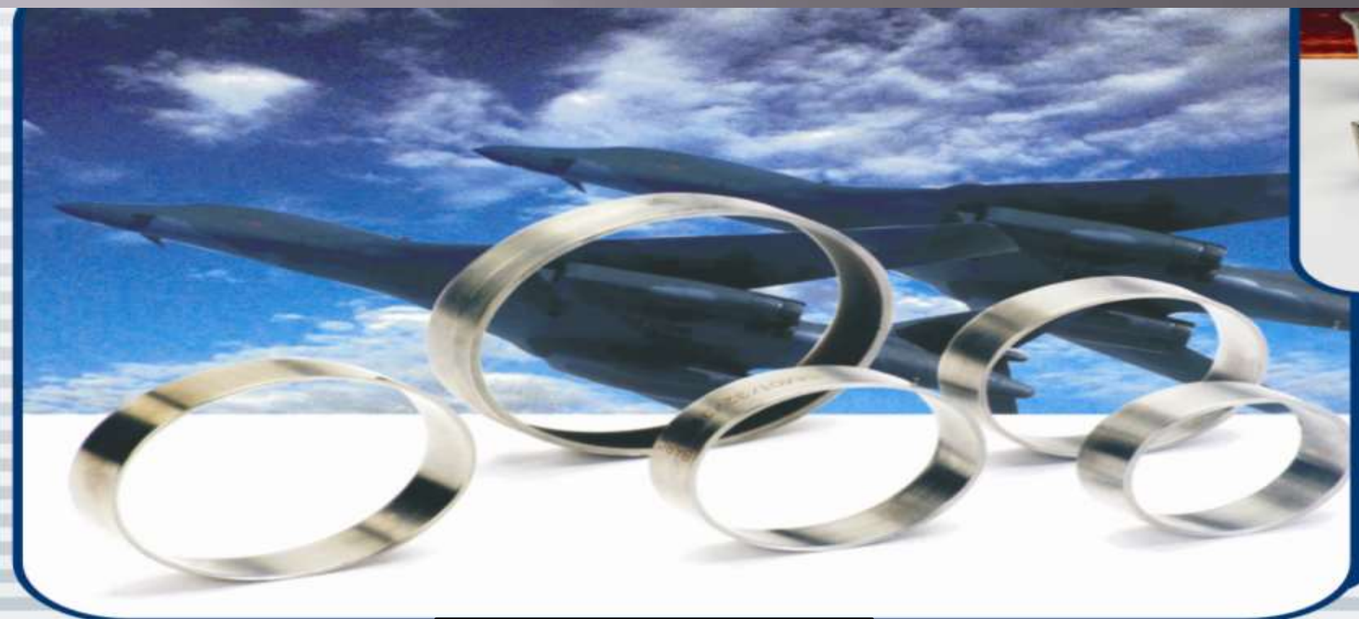
AEROSPACE (NiTi Rings)