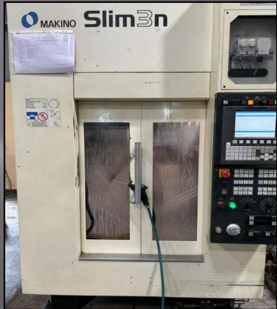
MAKINO SLIM3N '4-AXIS'