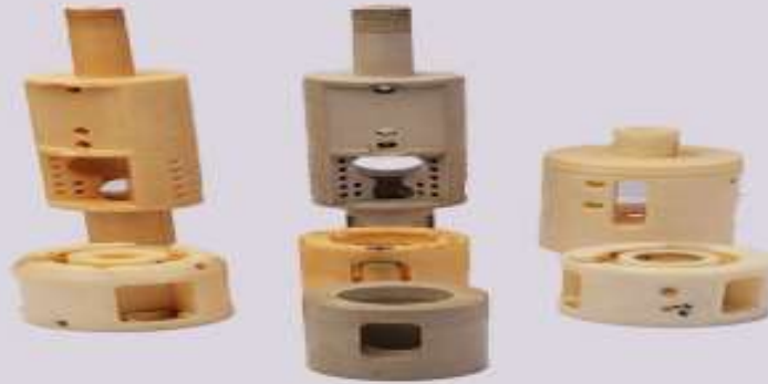
Instrumentation Industry Components