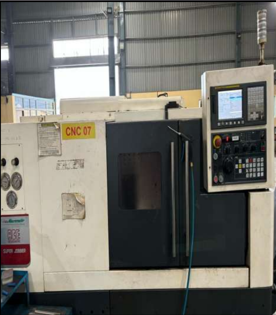
CNC LATHE - SWING DIA 300MM