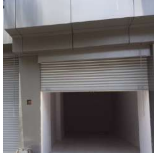
Rolling Shutters installed at Ajanta Apartments, Santacruz