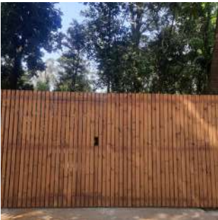
Swing Gate installed at Khandala with wood cladding