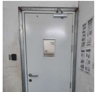
HMPS doors installed at Ambarnath MIDC