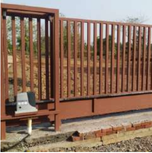
Motorised sliding gate installed at Badlapur