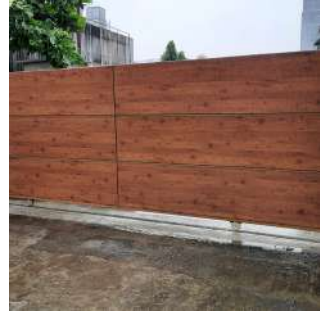
Sliding Gates installed at MIDC, Tarapur