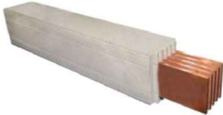
Low Voltage Cast Resin Insulated Busways (1kV upto 6600A)