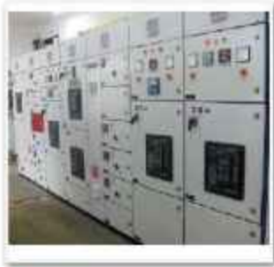
LV Power Control Center