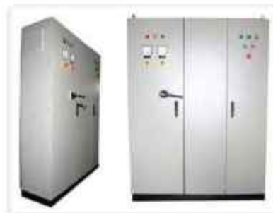
Soft Starter Panel