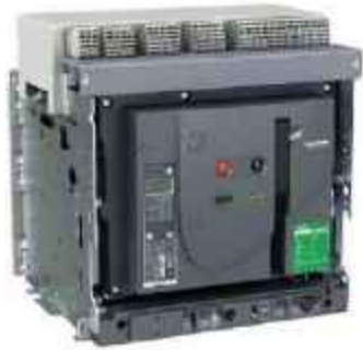
Air Circuit Breaker