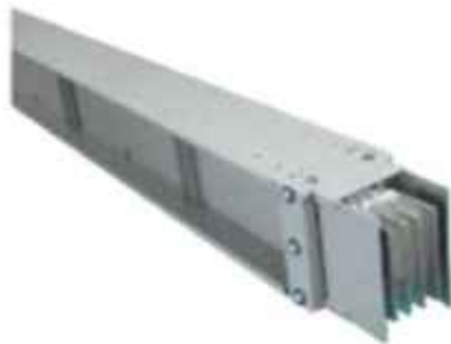
Sandwich Busbar Trunking System (Low-Impedance) (800-6300A)