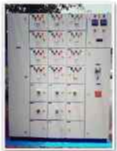
Motor Control Center