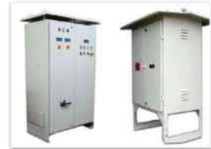
Feeder Pillar Panels