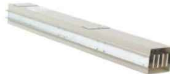
Air Insulated Busbar Trunking System (125-2000A)