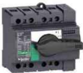
S.F.U - Switch Disconnector Fuse