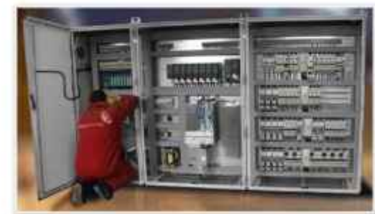
PLC / SCADA Panel